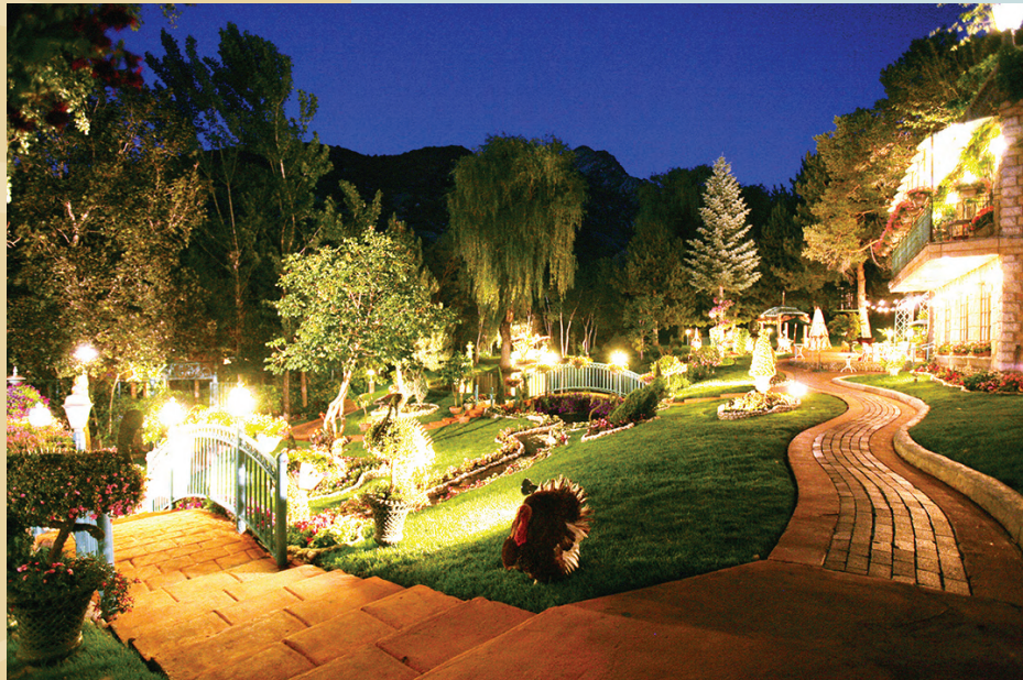
Site of the 2007 Arch C. Klumph Society Dinner

Another exciting feature of society membership is the annual Arch C. Klumph Society Dinner, held each year during the International Convention. This intimate event is an excellent way for members to meet like-minded Rotary leaders and celebrate all that has been done through their Foundation.